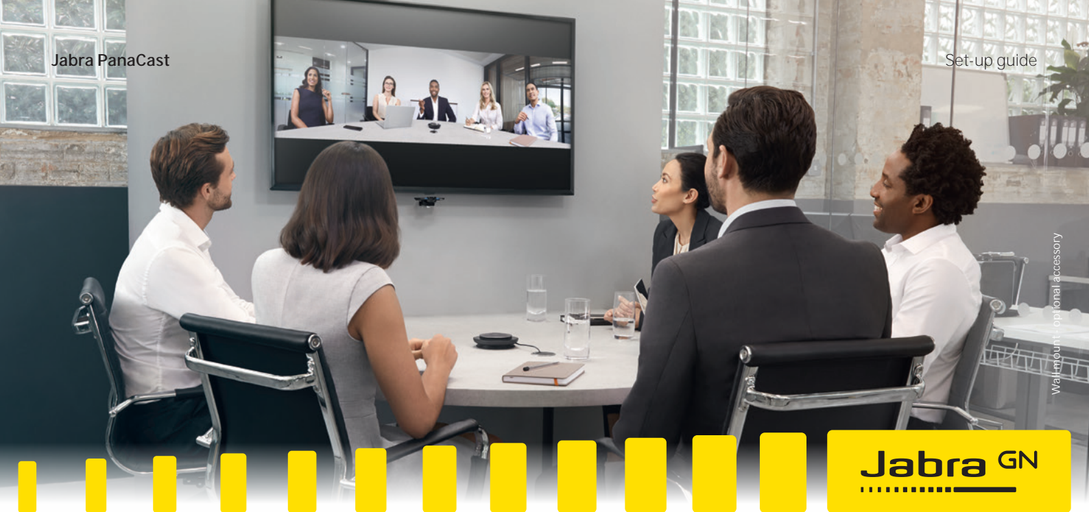
Wall mount is optional accessory