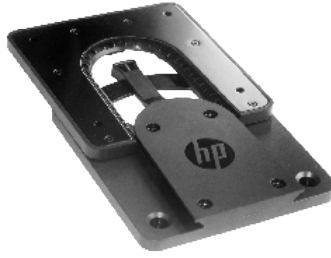
HP Quick Release Bracket 2