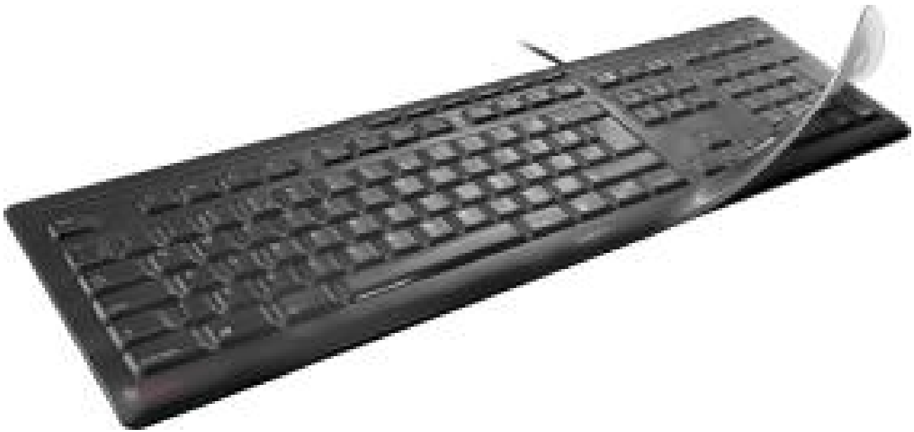
Picture: CHERRY STREAM KEYBOARD (JK-8500GB-2) with WetEx®-protective film