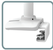
WHITE UNDER MOUNT C-CLAMP ACCESSORY 98-082: ATTACHES TO SURFACE EDGE