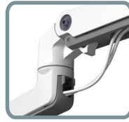
CABLES ROUTE BENEATH THE ARM, OUT OF THE WAY