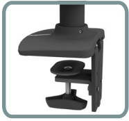
INCLUDED: STANDARD 2-PIECE DESK CLAMP ATTACHES TO SURFACE EDGE