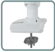
WHITE GROMMET MOUNT KIT ACCESSORY 98-035: ATTACHES THROUGH SURFACE HOLE