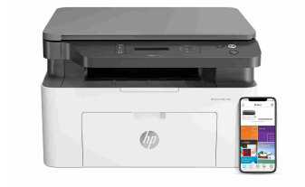
HP Laser MFP 135w