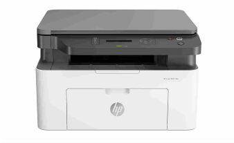
HP Laser MFP 135a

Get productive MFP performance at an affordable price. Print, scan, copy, and fax, 1 produce high-quality results, and print and scan from your phone. 2,3