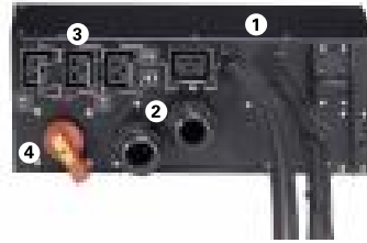
HotSwap MBP 11000