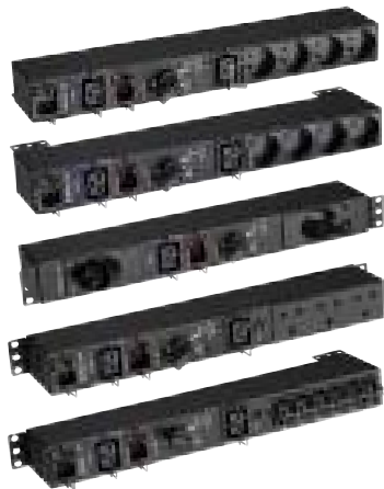
HotSwap MBP range