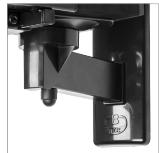
Supplied with cover plate and screw cap for a neat and tidy finish