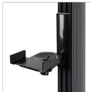
Can also be mounted directly to System X vertical columns or onto B-Tech collars for pole mounting