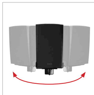
Tilt and swivel adjustment allows perfect positioning