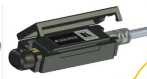
II: Close the Pulling Tool cover.