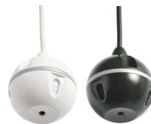
EasyMic Ceiling MicPODs (above) and EasyMic MicPOD (below)