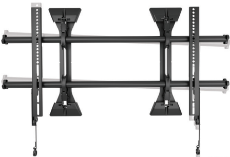
ControlZone Height & Roll Adjustment