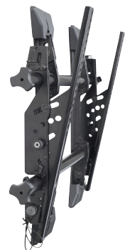
Centris Low-Profile Tilt