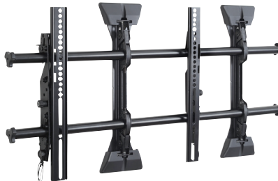
Centerless Lateral Shift