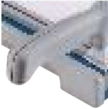
Ergonomically shaped handle to prevent tired hands while cutting