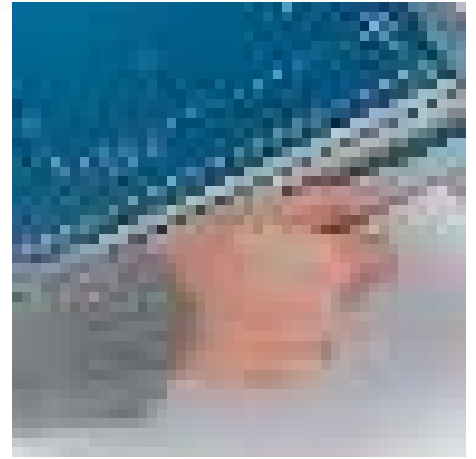
Practical recessed grips for safe and easy handling