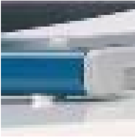
Non-slip rubber feet for firm standing