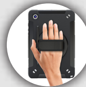
Resizable Hand Strap