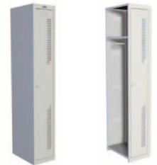
PL1130 - PL2160