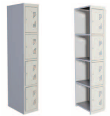
PL1430 - PL2460