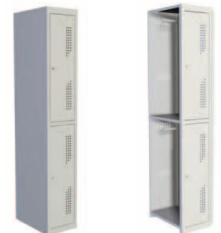
PL1230 - PL2260