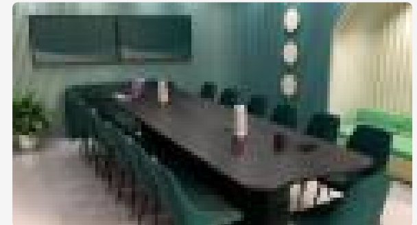
MEETING OWL 3 + MEETING OWL 3