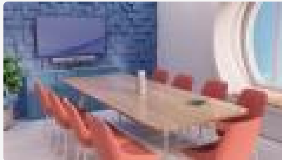
Meeting Owl 3 + Owl Bar

Wirelessly pair with the Owl Bar or a second Meeting Owl for collaboration in larger spaces