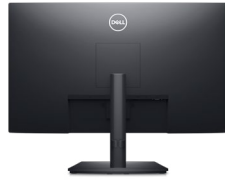
Back view - Cable management slot

Easily adjust the panel to your preferred viewing position.