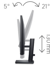
Tilt and height adjustable