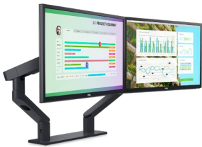
DELL DUAL MONITOR ARM | MDA20

This comprehensive dual monitor and system mounting solution keeps your desk clutter-free. Simple to install, this innovative monitor arm offers swivel angle adjustment with the flip of a switch.