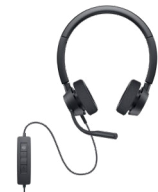
DELL PRO STEREO HEADSET | WH3022

Enhance your everyday productivity with a quiet full size keyboard and mouse combo that offers programmable shortcuts and 36 months** battery life.