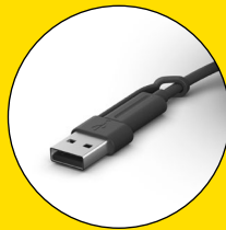
USB C and USB A connectors included