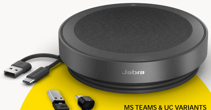
MS TEAMS & UC VARIANTS

To help consider our planet, we consider sustainability carefully at every stage of product development. The casing of Speak2 75 is made with over 33% sustainable materials 3 , and has a number of built-in parts that can be repaired or replaced. Better sustainability = longer speaker life = great calls for you and your team for years to come.