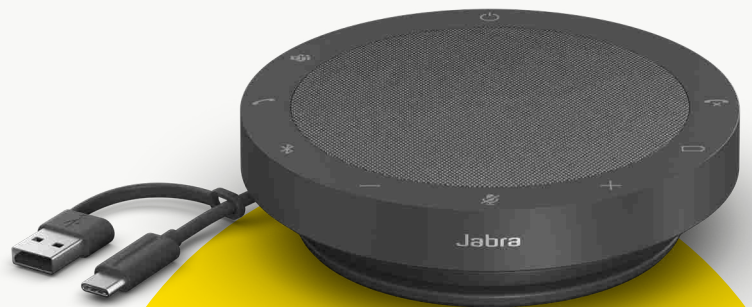
MS TEAMS & UC VARIANTS

We consider sustainability carefully at every stage of product development. The casing of Speak2 55 is made with over 50% sustainable materials**, and has a number of built-in parts that can be repaired or replaced. Better sustainability = longer speaker life = great calls for you and your team for years to come.