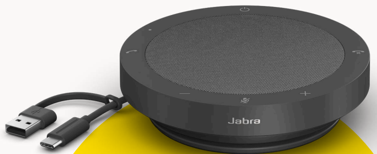
MS TEAMS & UC VARIANTS

To help take care of our planet, we consider sustainability carefully at every stage of product development. The outer casing of Speak2 40 is made with over 50% sustainable materials** and has a number of built-in parts that can be repaired or replaced. Better sustainability = longer speaker life = great calls for you and your team for years to come.