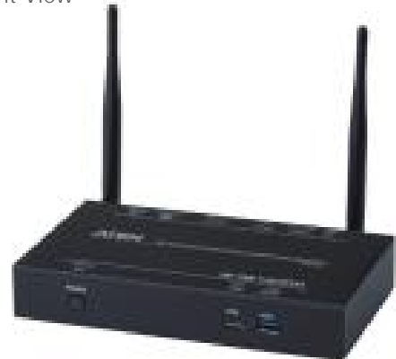
VP2021 Front View