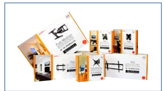
Comes in color packaging with included installation hardware and easy to follow instructions.

Please visit peerless-av.com/en-us/patents for patent information.