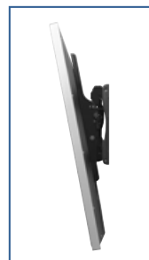
+15°/-5° of tilt for versatile viewing angles.