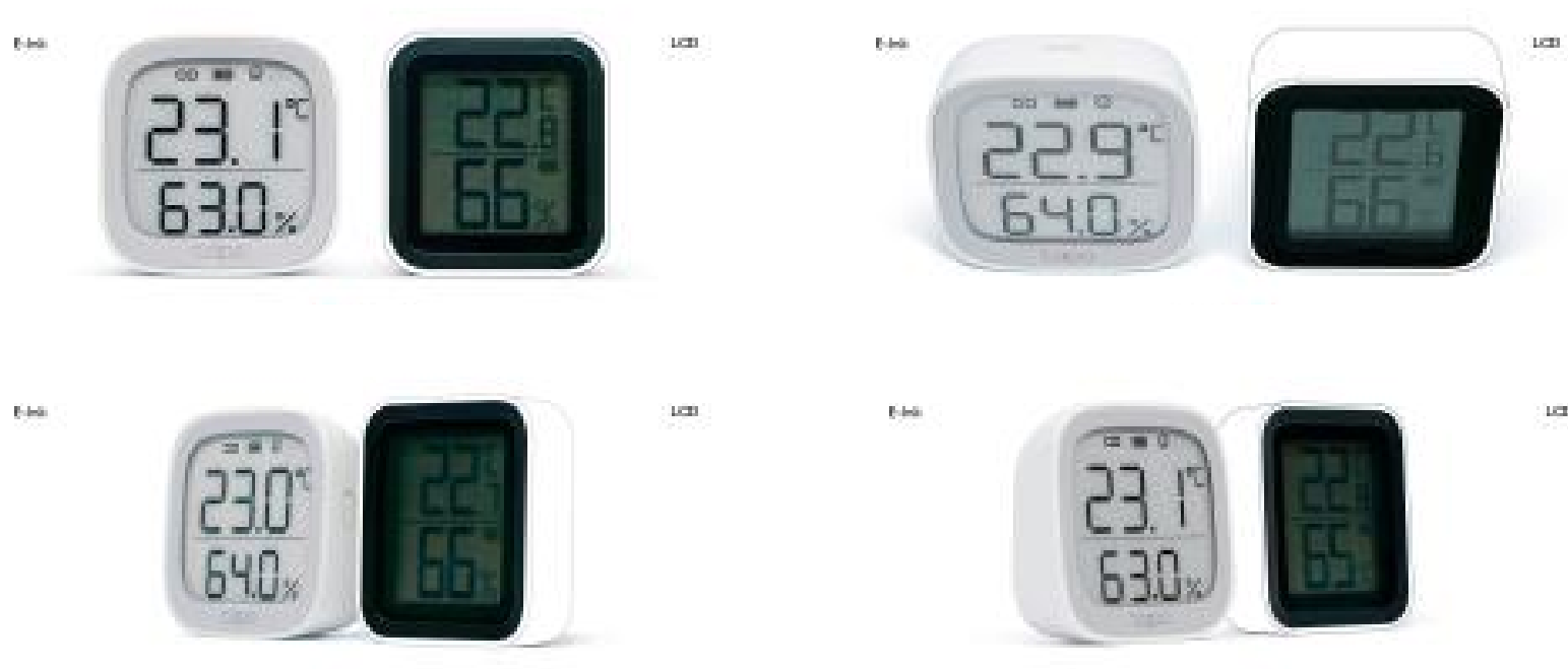
Comparison between an E-ink display and a backlit display.

Features a 2.7" E-ink display that reads like real paper. No screen glare and daylight readable with a 180 degree viewing angle.