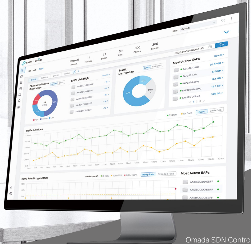
Omada SDN Controller