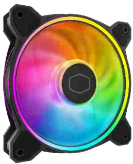
Intuitive ARGB Detection

Intuitive LED detection automatically provides default ARGB spectrum lighting or full ARGB customization via 3-pin header connection.