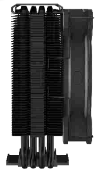
Wide Range Compatibility

4 heat pipes with black finish provide exceptional cooling and aesthetics