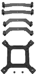
Upgraded Installation Brackets

Compact 154mm height designed for wide chassis compatibility without sacrificing performance