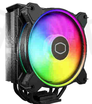
Clean Black Finish

Upscale design featuring aluminum top cover and signature logo