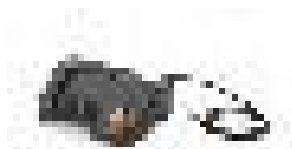
Single-bay Ethernet Cradle