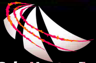
Gale Hunter Fan

Plug and party. Shine in consistency. Excellent compatibility guaranteed. No need of any software control, the board lighting can be easily synced with any other ARGB-supported devices with just a single cable.