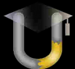
Composite Heat Pipes

Compact in size, strong in protection. The Anti-Gravity Plate with optimized size offers the strongest protection to the board, preventing the board from bending.