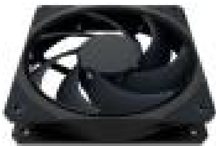
Ring Blade Design (RBD)

Interconnecting fan blades designed for a reinforced and rigid structure, eliminating vibration for stable fan rotation.