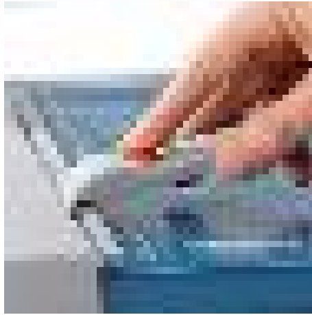
Adjustable backstop for quickly finding the right format - can be used on both scale bars