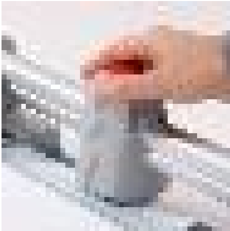
Ergonomic cutting head for convenient cutting-machine operation