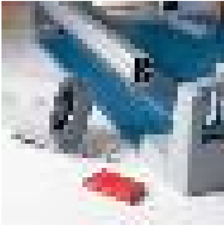
Easy-to-change cutting head to keep work processes running smoothly