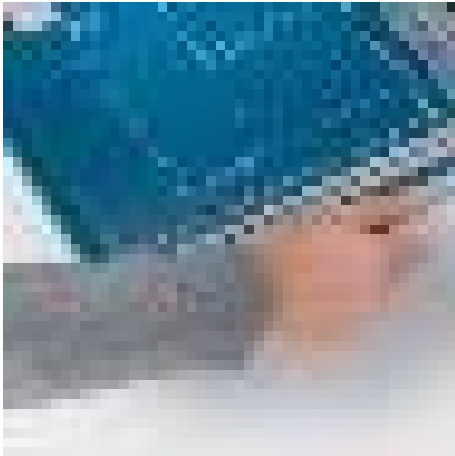
Practical recessed grips for safe and easy handling