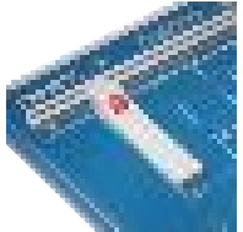
Two scale bars with mm scale for an exact 90° cut