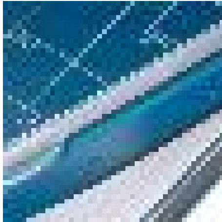
Sturdy, solid-steel blade holder for optimum guidance of the screw-mounted upper blade