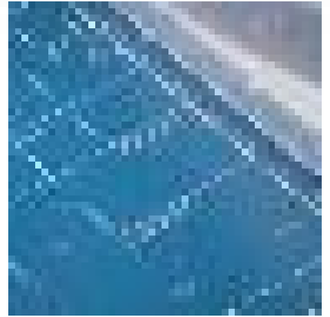
Practical format lines on the table with mm graduation along the cutting edge facilitate alignment of the material being cut