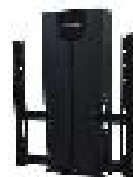
LD-X (Light Duty with Extension)