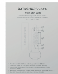
Quick Start Guide