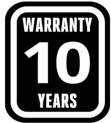
10 Year Warranty