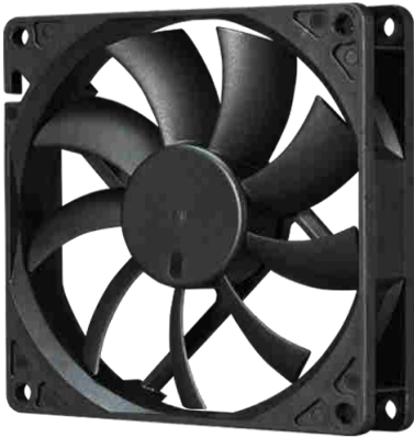
Quiet FDB Fan