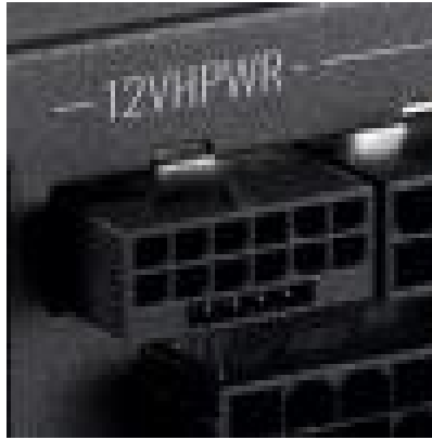
Fully support ATX3.0