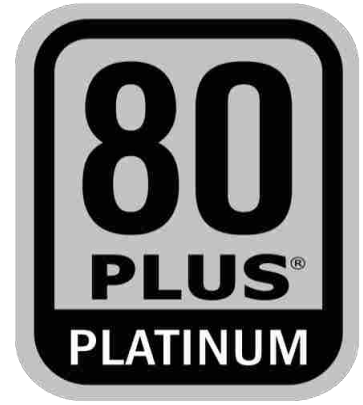
80 PLUS Platinum Certified