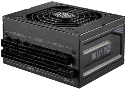
SFX Form Factor