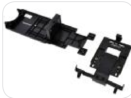
Universal Tablet Cradle 80-106-085