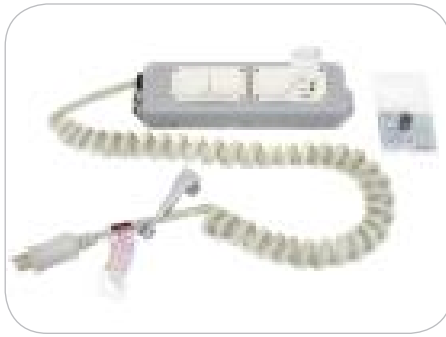
Medical-Grade Power Strip 97-466-214 (Available North America)