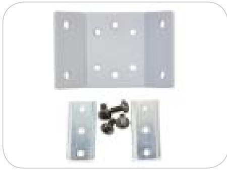
Interface Bracket Kit 60-587-207