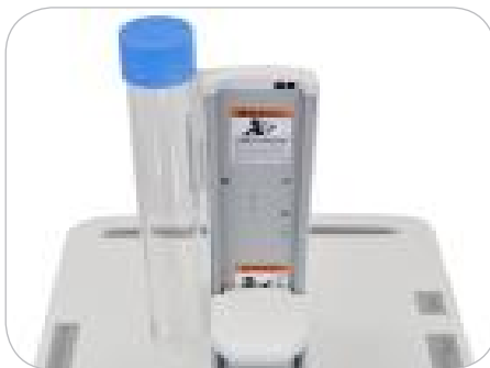
SV cart with medication cup dispenser adhered to 5" lift