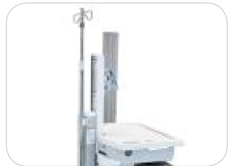
SV cart with IV Pole attached via Ergotron's StyleView IV Pole Clamp Kit