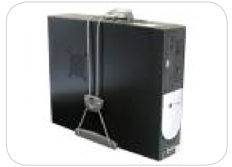
Universal CPU Holder 80-105-064