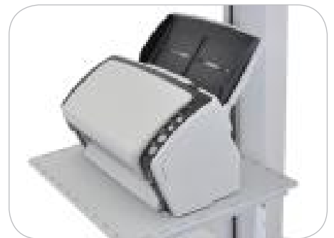
SV cart with scanner/printer placed on Ergotron's Large Utility Shelf 97-540-053 and attached with the T-Slot Bracket 60-575-003

© 2012 Ergotron, Inc. rev. 02/28/2012 Content is subject to change without notification