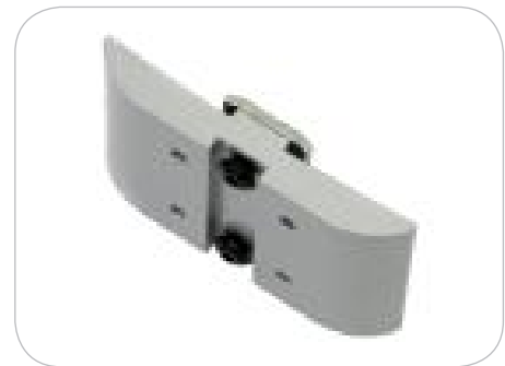
T-Slot Bracket 60-575-003