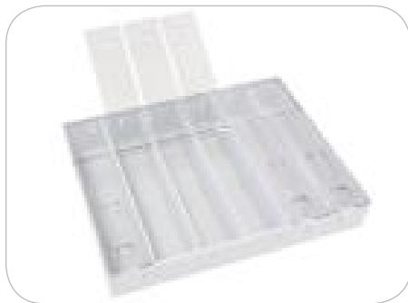
StyleView Medical Drawer Tray Accessory 97-450