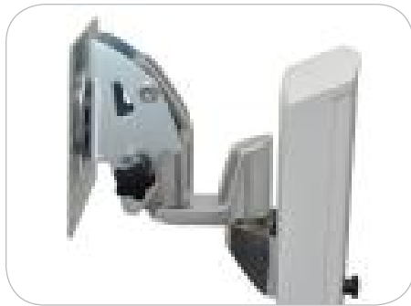
SV Cart LCD Pan Pivot Kit 97-650