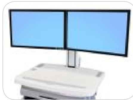
SV Dual Display Kit 97-574