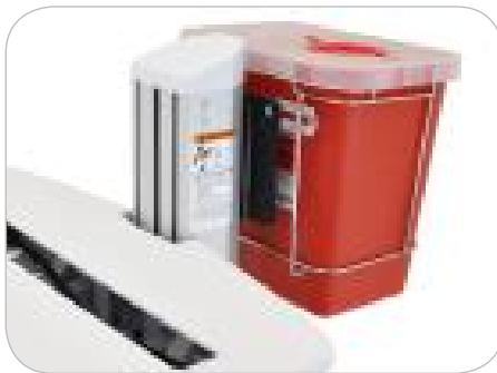
SV cart with large Sharps container (5 quart) and wall mount bracket attached via Ergotron's VESA Mount Kit 97-512-009