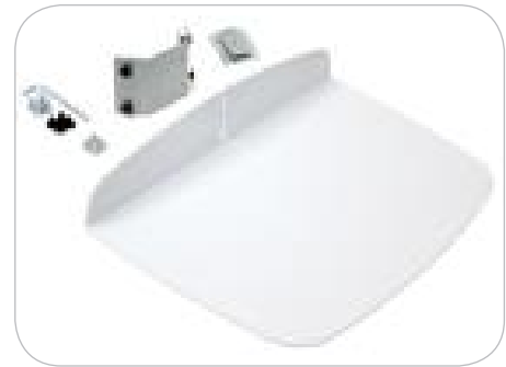
Utility Shelf 97-507-216