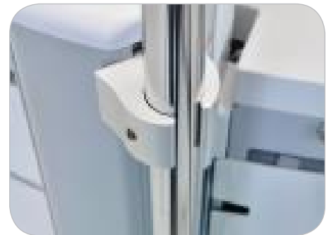
StyleView IV Pole Clamp Kit 97-632