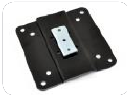
SV Rear VESA Mount Kit 97-512-009