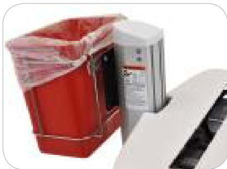
SV cart with waste basket (5 quart) and wall mount bracket attached via Ergotron's VESA Mount Kit 97-512-009