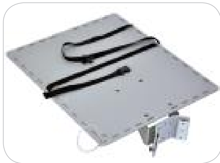
Large Utility Shelf 97-540-053