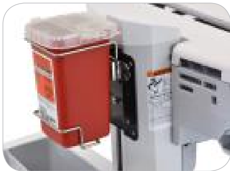
SV cart with small Sharps container and wall mount bracket attached via Ergotron's VESA Mount Kit 97-512-009