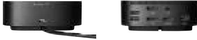
HP USB-C/A Universal Dock G2