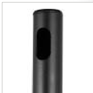
Integrated cable management and end cap for a tidy finish