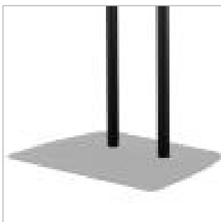
Compatible with a B-Tech's range of floor bases (BT4000 / BT4001 / BT4002)