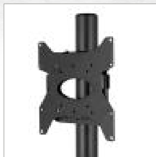
Fit B-Tech screen mounts to the pole using a BT7052 or a BT7841 collar