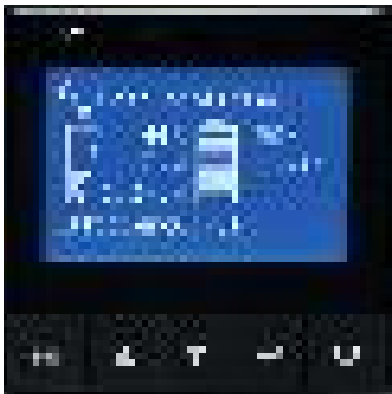
9SX graphical LCD