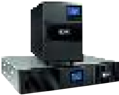
9SX Rack & Tower models