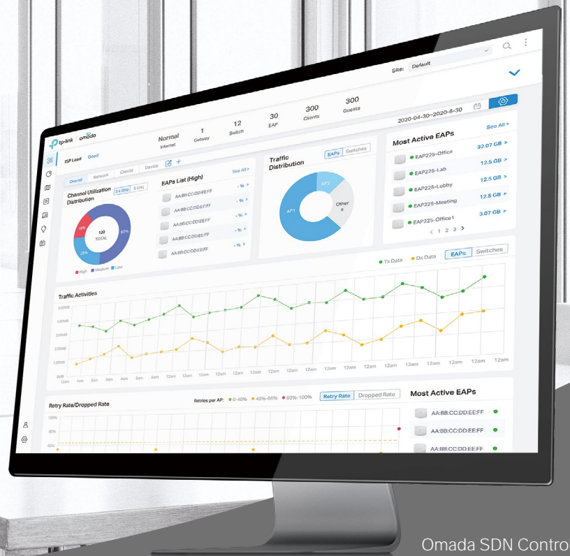
Omada SDN Controller