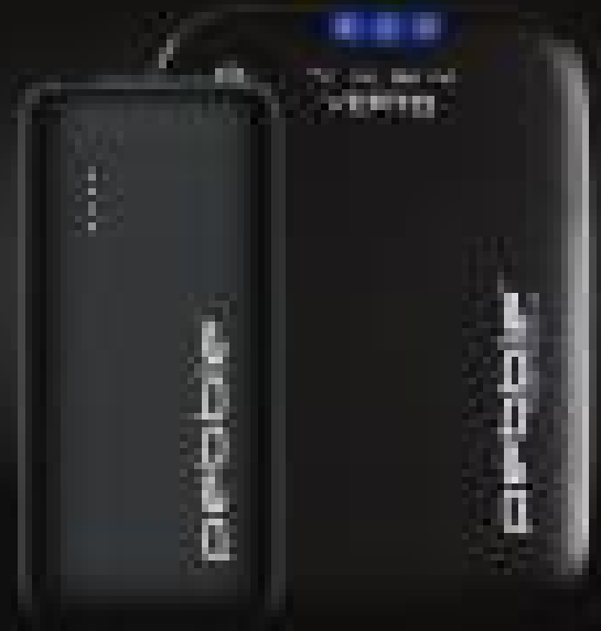
Pebble PZ5 5,000mAh (WYG 21700 li-ion cells) compared with Pebble Verto 3,700mAh (older li-ion cells)

Auto shut-off mode to protect against short circuit, over-current, over-charging and over-discharging.