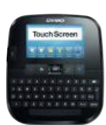
LabelManager™ 500TS Large, full colour touch-screen