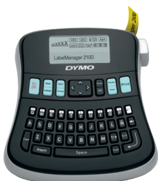
LabelManager™ 210D Large screen lets you see text before you print