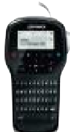
LabelManager™ 280 Fast and intuitive