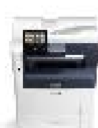
Xerox® VersaLink B405 Multifunction Printer