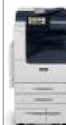
Xerox® VersaLink B7125/B7130/B7135 Multifunction Printer