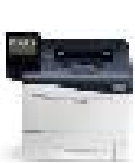
Xerox® VersaLink® C400 Colour Printer