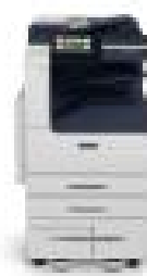
Xerox® VersaLink C7120/C7125/C7130 Colour Multifunction Printer