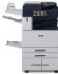
Xerox® AltaLink® C8130/C8135/C8145/C8155/C8170 Colour Multifunction Printer