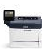
Xerox® VersaLink B400 Printer