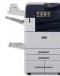
Xerox® AltaLink B8145/B8155/B8170 Multifunction Printer

To learn more about Xerox® ConnectKey Technology, go to www.xerox.ca/en-ca/connectkey .