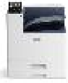
Xerox® VersaLink C8000 Colour Printer