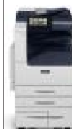
Xerox® VersaLink B7125/B7130/B7135 Multifunction Printer