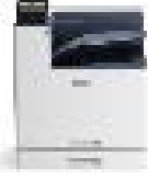
Xerox® VersaLink C9000 Colour Printer