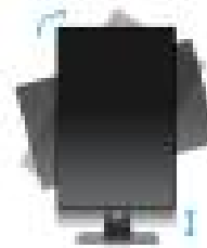
HAS (150mm) + PIVOT

A typical CCFL LCD uses four backlight lamps. Using LED diodes considerably lowers the power consumption and reduces the CO 2 emission into the environment making this LCD a true ECO-Friendly product.