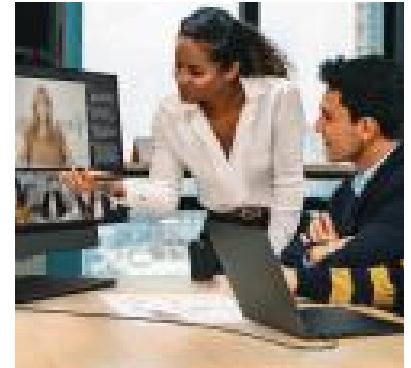
Small rooms for video conferencing and healthcare consultations