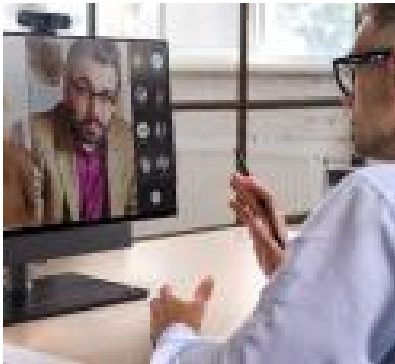
Executive desk, telehealth, remote learning, and phone booth