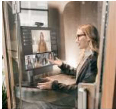
Virtual reception, hoteling, and hotdesking