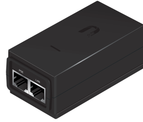
POE-15-12W POE-24-12W POE-24-12W-G