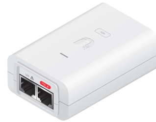
POE-24-24W-G-WH POE-48-24W-WH POE-48-24W-G-WH