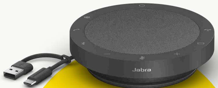
MS TEAMS & UC VARIANTS

We consider sustainability carefully at every stage of product development. The casing of Speak2 55 is made with over 50% sustainable materials**, and has a number of built-in parts that can be repaired or replaced. Better sustainability = longer speaker life = great calls for you and your team for years to come.