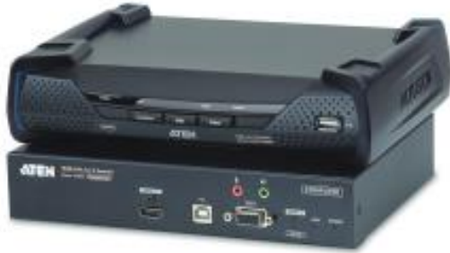
KE8950T / KE8950R Front View