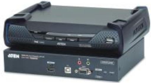
KE8952T / KE8952R Front View