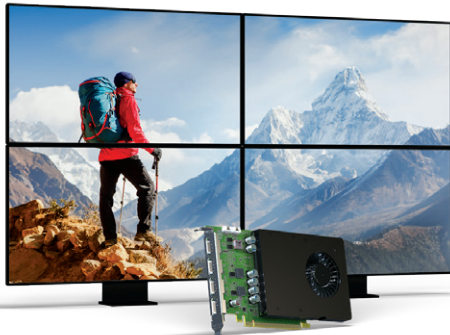
D-Series D1450 - Quad HDMI graphics card

Full-height, Gen 3 PCIe® x16 four-output graphics cards with four native HDMI® or DisplayPort™ connectors deliver the best display density, resolution, and performance for demanding multi-monitor applications.