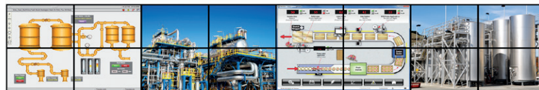
View critical information across an expansive configuration

Matrox D-Series supports numerous types of video walls and helps you create the optimal setup for every need. With a single card you can power four-monitor video walls to deliver high-impact configurations. By combining four cards, you can build larger 16-monitor video walls, or create even larger scale video walls by pairing the D-Series cards with the Matrox QuadHead2Go multi-monitor controller cards or appliances.