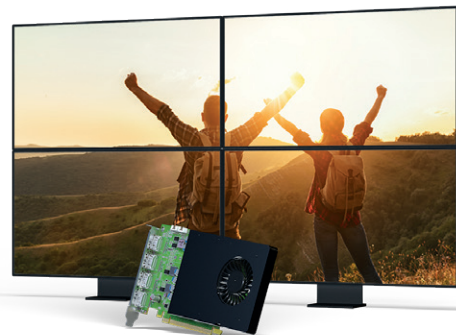
D-Series D1480 - Quad DisplayPort graphics card