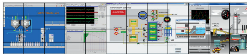
Combine with Matrox QuadHead2Go to build large-scale video walls