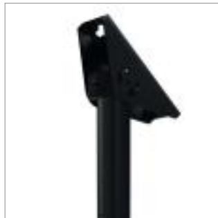
Ceiling plate can be mounted onto a ceiling with angles up to 90°