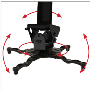
Features easy tilt, roll & swivel functions