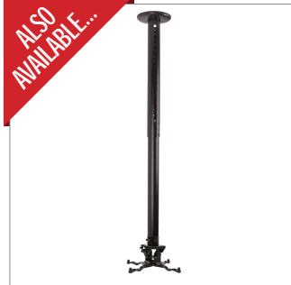
BT899-AD Projector Mount features an adjustable drop that allows users to easily adjust the height of the mount