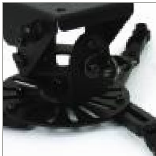
Optional micro-adjustment feature ideal for use with short throw projectors