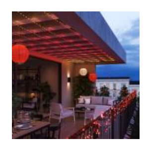
Special string light styles