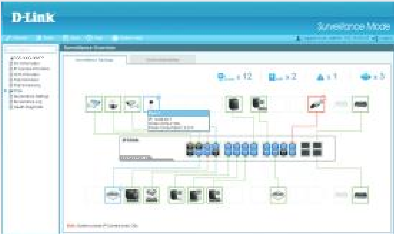
Device Information Web Interface Screenshot